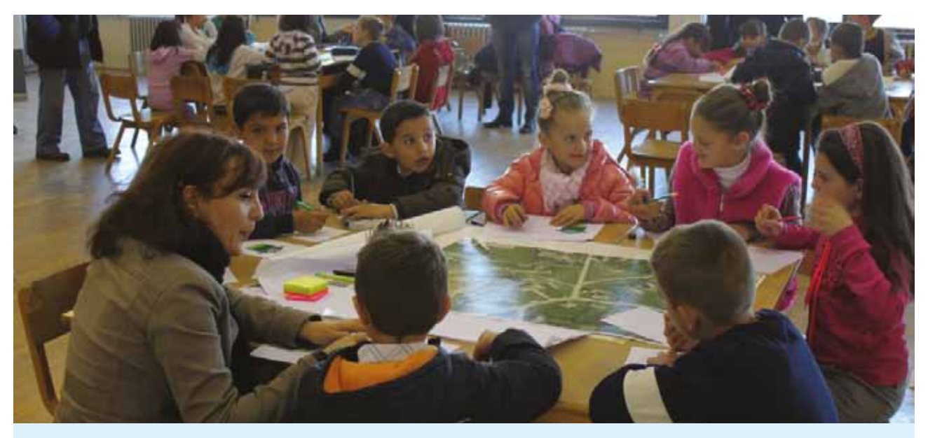
CIP Graçanicë/Gračanica, Citizens, Parents, Teachers and Pupils are putting first ideas on the paper for the Schoolyard