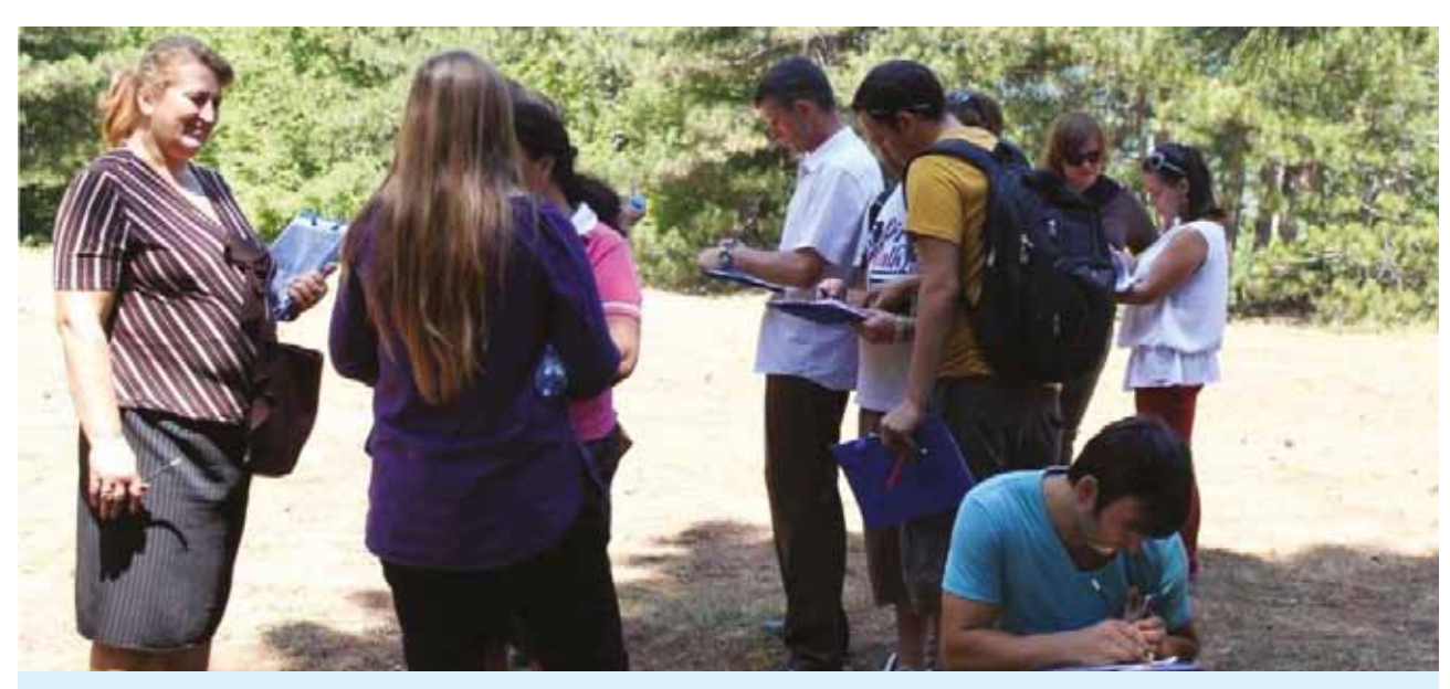
Capital Investment Project Moronica Park - Junik Municipality

Project summary: The improvement of schoolyards has been selected as a development priority identified by different MuSPP partner municipalities through the municipal participatory planning process. UNHabitat proposed a new model for school improvement and civic engagement to foster environmentally balanced, dynamic learning environments. The 'sustainable schoolyard' approach provides students with a place to learn and socialise, a schoolyard that promotes inclusiveness and a sense of place. Sustainable schoolyards also provide opportunities to learn about nature, while improving the school conditions by creating outdoor classrooms, spaces for physical activities, play, sports and recreation.