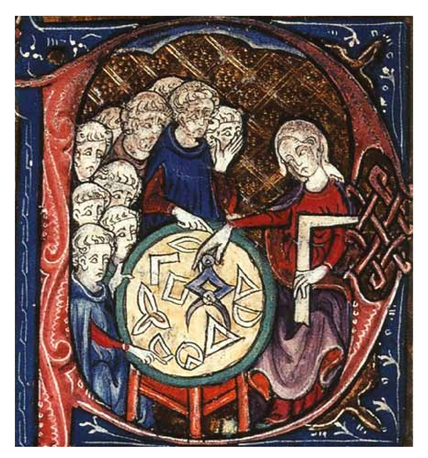
A woman teaching geometry: Illuminated initial from a medieval translation of ancient philosophical works, 1265-99. MS Burney 275, fo. 293. Reprinted in The Making of the Middle Ages, R. W. Southern. London: The Folio Society, 1998. Copyright 1953. Plate following p. 192.

Understanding women and men's different needs and interaction is a valuable foundation to decision makers, planners, designers, and other stakeholders in the process of spatial planning so that they may analyse and incorporate a gender perspective in the formulation of development frameworks that are suited to the social context.