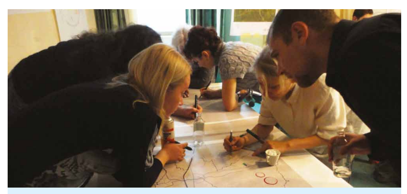
MDP Graçanicë/Gračanica - Planning process