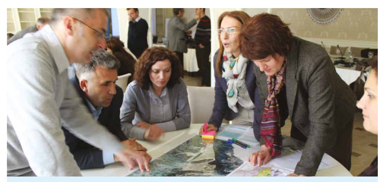
Planning process on the National Park "Bjeshket e Nemuna" Spatial Plan, incorporating environmental component / SEA process