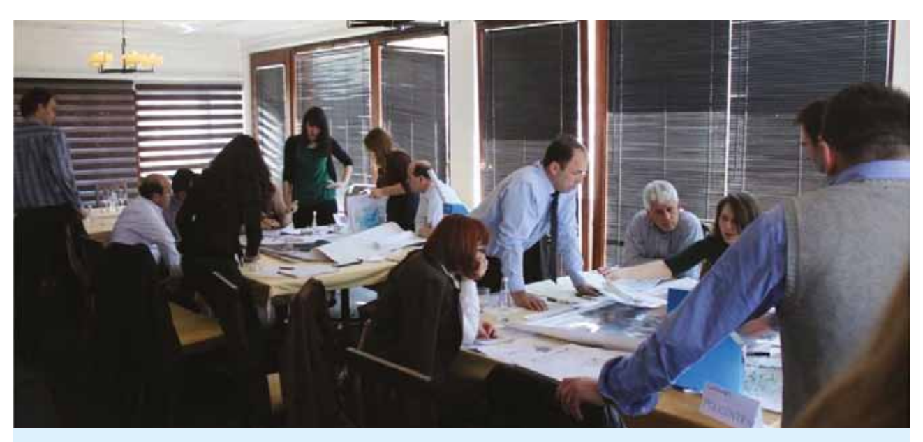
Malishevë /Mališevo, MDP Process- Scenario Building Workshop