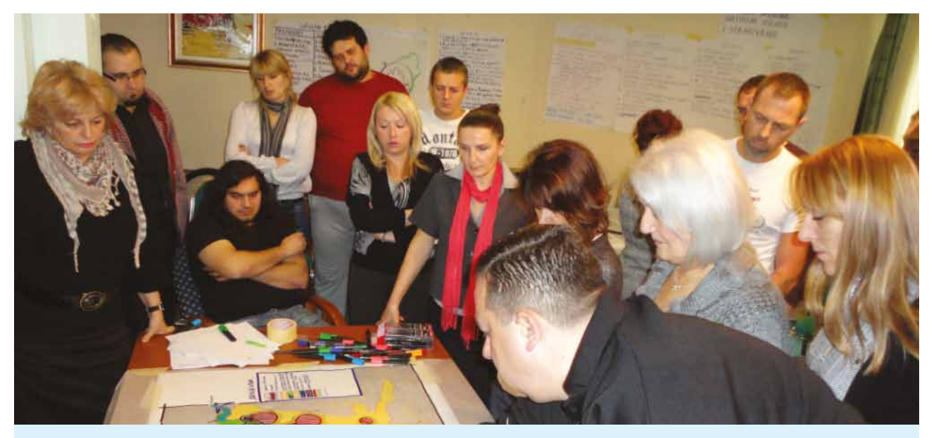
Graçanicë/Gračanica , MDP process