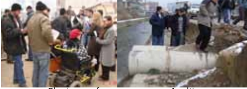
Photos from area Audit

perceived from numerous perspectives, recorded through questionnaires filled by each participant.