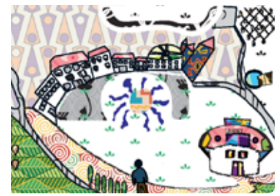
draft- MUNICIPAL DEVELOPMENT PLAN OF JUNIK 2010 - 2023 +