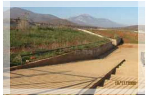
World Habitat Day in junik, 2009