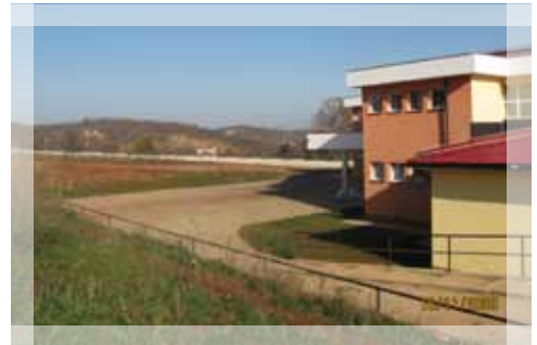
The view from the school yard "Kuvendi i Junikut", before the implementation

The lack of sports and recreational fields is the main issue for the community of Junik particularly for the youth and active citizens interested in sports and culture. Taking into consideration that there is no vacant land in the municipal property, it is clear that the school's yard may fulfil a broader role.