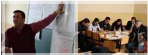
Views from the first workshop

In the first workshop some idea proposals of the location of the project were prepared through the group work. Strengths, weaknesses, opportunities and threats were identified through SWOT analysis as well as the questionnaire was filled up by all participants.