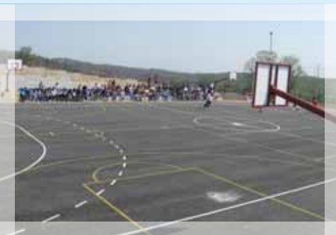
The site during the implementation of the project and after its completion