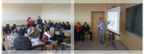
Views from the second workshop

In the second workshop two scenarios with idea proposals were designed based on work and results from the first workshop .