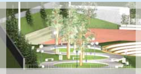
3D Views of the final scenario