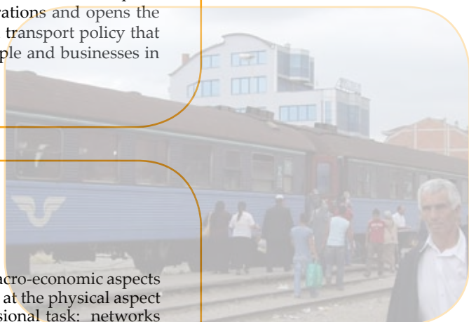
Express train to Skopje, stopping in Ferizaj/Urosevac