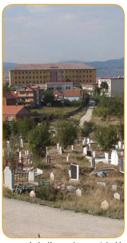
graveyards in Kosovo in a sustainable way.

Elements to take into consideration are a green environment for citizens, improvement of old parts, respect for burial rituals of different cultures, elementary design elements (monuments, religious infrastructure...) and the integration in urban environment (extra muros). Finally, a system of management and maintenance will be elaborated by implementing legal regulations for burial places and a system of concession and financial management. The project will be implemented in a participatory manner, especially because of the multiethnic character. The approach and results could be used to solve the problem of