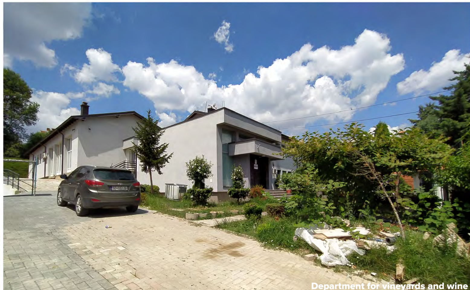
Department for vineyards and wine